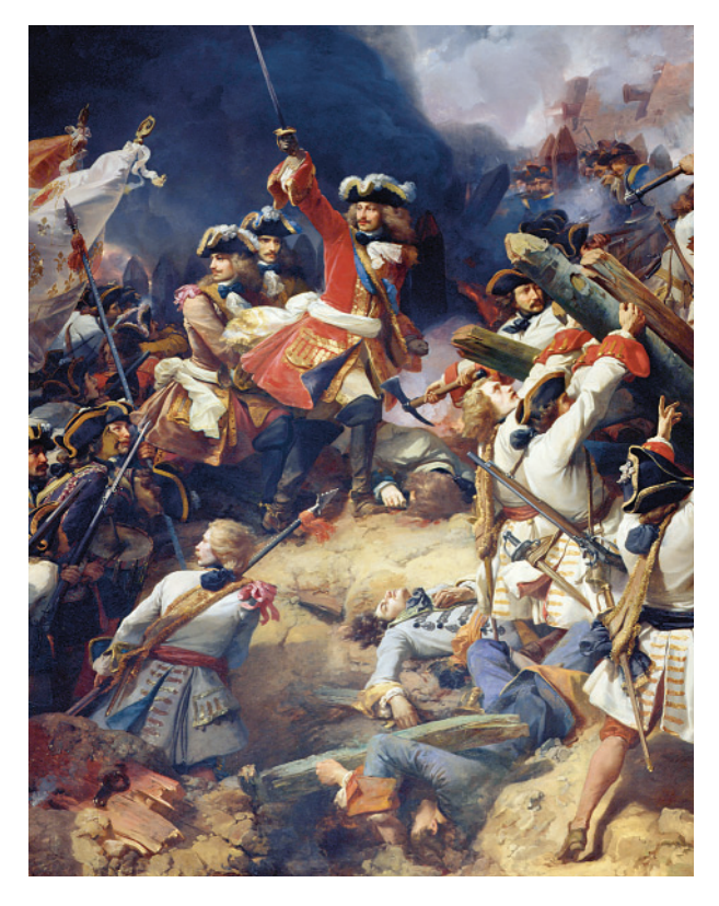
Absolute Monarchs in Europe 601

▼ The painting below shows the Battle of Denain, one of the last battles fought during the War of the Spanish Succession.