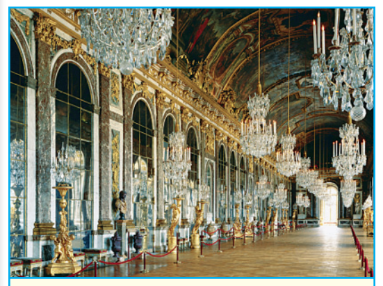
Many people consider the Hall of Mirrors the most beautiful room in the palace. Along one wall are 17 tall mirrors. The opposite wall has 17 windows that open onto the gardens. The hall has gilded statues, crystal chandeliers, and a painted ceiling.

Louis XIV's palace at Versailles was proof of his absolute power. Only a ruler with total control over his country's economy could afford such a lavish palace. It cost an estimated $2.5 billion in 2003 dollars. Louis XIV was also able to force 36,000 laborers and 6,000 horses to work on the project.