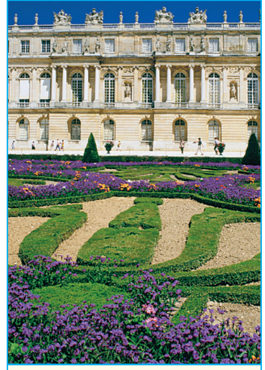
The gardens at Versailles remain beautiful today. Originally, Versailles was built with: • 5,000 acres of gardens, lawns, and woods • 1,400 fountains