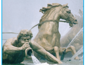
It took so much water to run all the fountains at once that it was done only for special events. On other days, when the king walked in the garden, servants would turn on fountains just before he reached them. The fountains were turned off after he walked away.